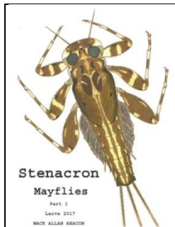
Stenacron Mayflies 2020 Mack A Beacon Larvae and Adults