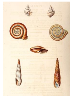
Conchology, or, The natural history of shells Read more here: George Perry