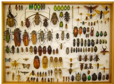
ESA Position Statement on the Importance of Entomological Collections