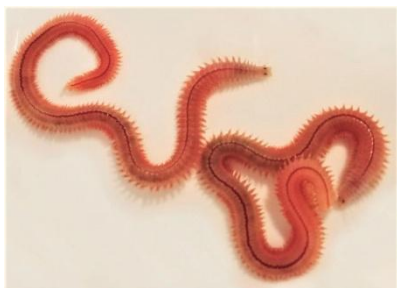
13th International Polychaete Conference Free access presentations